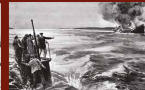
◀ The final moments of the Turkish troopship and transport Guy Djemal. The original caption states: 'On one occasion when Commander Boyle in the E14 came up to the surface to take his bearings while making his way into the Sea of Marmara, he saw through his periscope the reflected image of a Turkish gunboat. He immediately edged his vessel round, took aim, then gave a couple of orders and 300lbs of gun-cotton was tearing towards the hapless Turkish gunboat. In a few seconds the submarine rocked to a terrific explosion.'