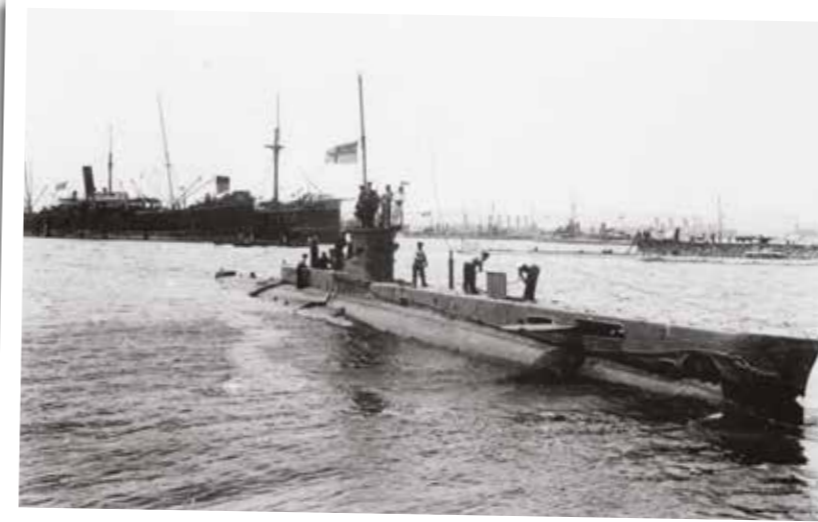
▲ HMS E14 pictured heading towards the Dardanelles Strait en route for the Sea of Marmara. A variety of shipping, including the new French submarine Mariotte , can be seen in the background.

The first full day in the Marmara was a troubled one as the submarine was repeatedly forced to dive after attracting enemy fire. The next day went better after Boyle spotted four enemy destroyers at 12.30 hours, then, just 45 minutes later, two troopships with three escorting destroyers.