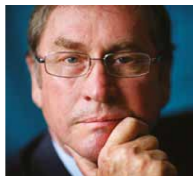
LORD ASHCROFT'S "HERO OF THE MONTH"

By 1915 Lieutenant Commander (later Rear Admiral) Edward Boyle was one of the most experienced submarine officers in the Royal Navy. It was his involvement in the Dardanelles Campaign that led to the award of the Victoria Cross.