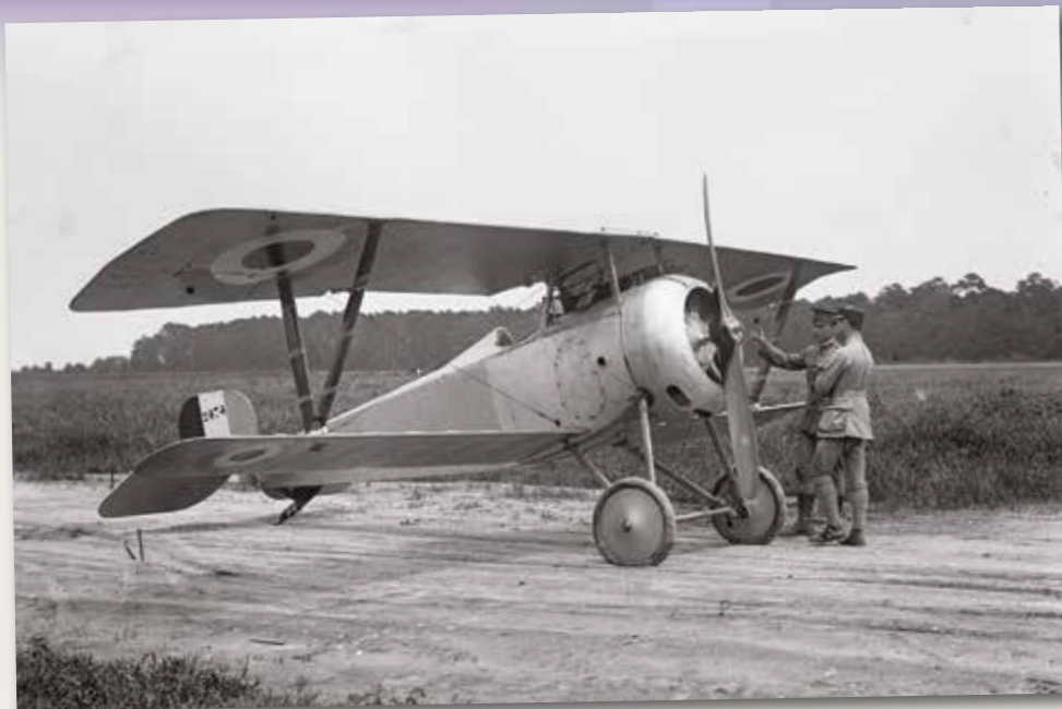
LEFT: An example of a Nieuport Scout, an aircraft flown by many British and French airmen on the Western Front during the First World War – including Wray during his time with 29 Squadron. In 1917 the type was one of the few machines which allowed British squadrons to fight back during the so-called “Bloody April”. Historians have found it difficult to identify how many of each Nieuport type were operated by the RFC as its surviving records tend to only specify “Nieuport Scout”.