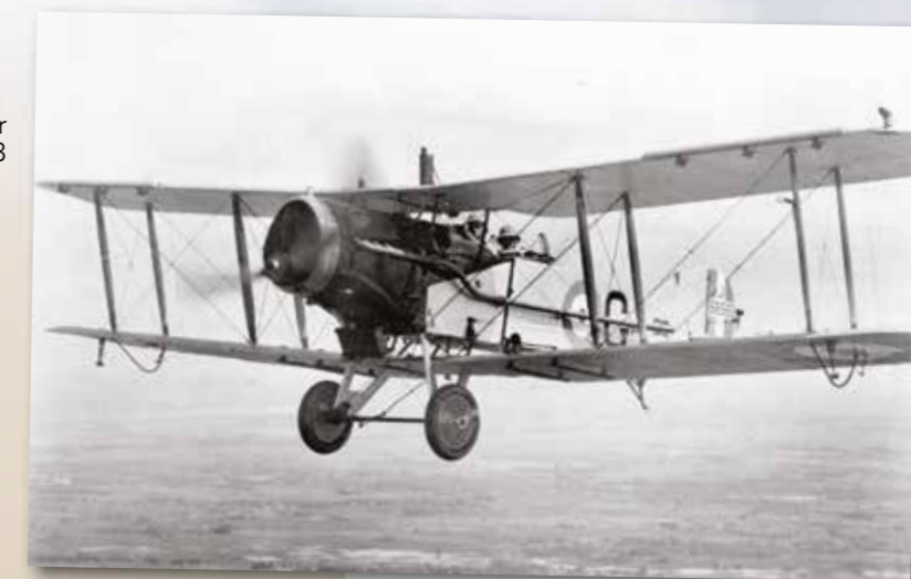
TOP: The Shuttleworth Aircraft Collection's Bristol F.2B Fighter. D8096 was built in 1918, but was too late to see service during the First World War.